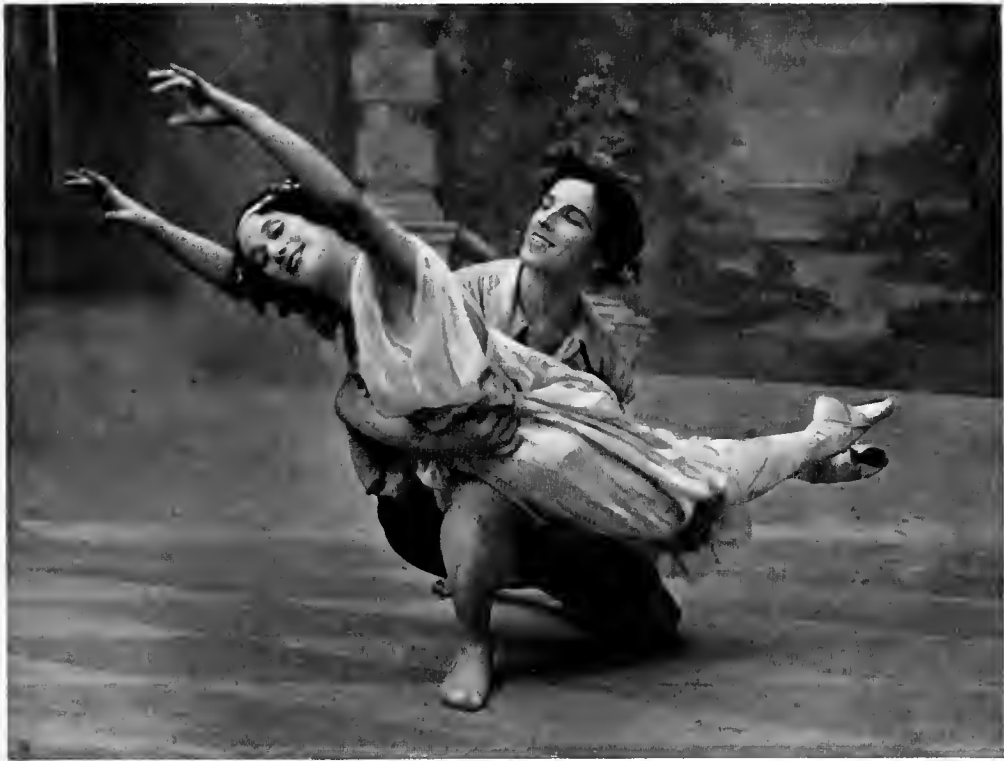
Dover Street Studios